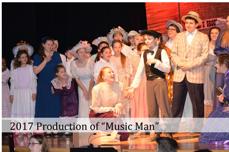
2017 Production of "Music Man"